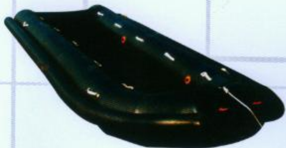
KHP-(I)漂流舟 KHP-(I) TYPE DRIFTING BOAT