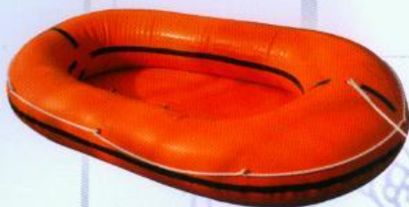
手划艇 HAND ROWBOAT