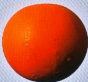
浮球 FLOATING BALL