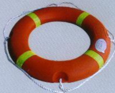
救生圈 LIFE BUOY