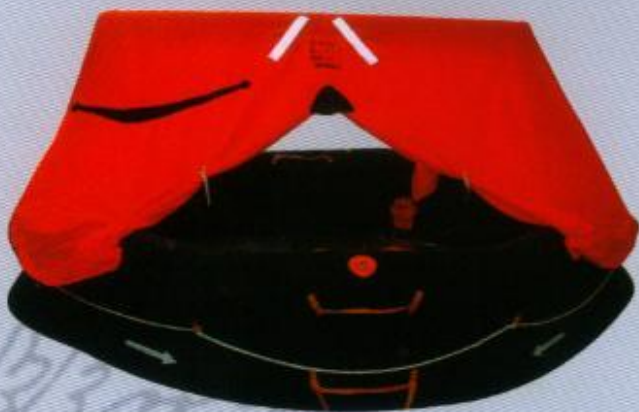
QJF-Y型气胀救生筏 QJF-Y TYPE INFLATABLE LIFERAFTS