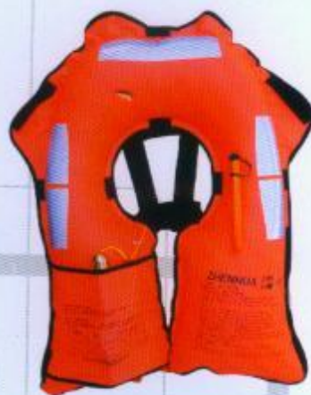
气胀式救生衣 INFLATABLE LIFE JACKET