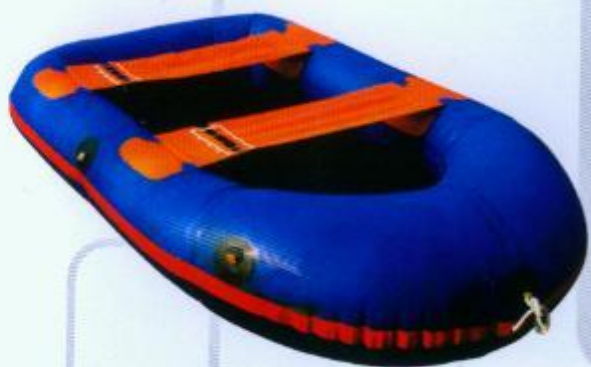
手划艇 HAND ROWBOAT