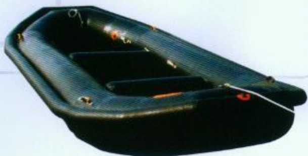
KHP-(II)漂流舟 KHP-(II) TYPE DRIFTING BOAT