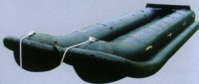
KHJ-H10 机动舟 KHJ-H10 TYPE MOTO BOOT