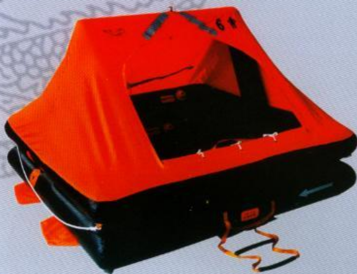
QJF-YJ型气胀救生筏 QJF-YJ TYPE INFLATABLE LIFERAFTS