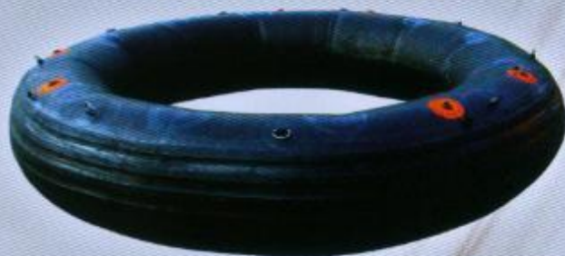
碰碰胎 BUMP CHAMBER