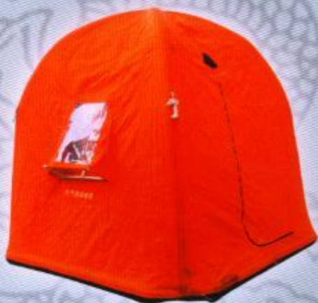
充气帐篷 GAS INFLATION TENT